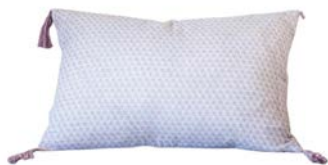
NATTI PRINT CUSHION MAUVE 30X50CM | AHCU252 100% COTTON MUSLIN £45