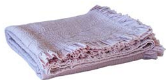
ALTA BEDPSREAD BLUSH 220X230CM | AHBD111 100% COTTON £235