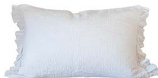
ALTA CUSHION WHITE 40X60CM | AHCU258 100% COTTON £70