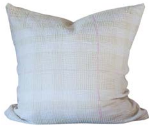
MIA GAUZE CHECK PILLOW OLIVE/PINK 65X65CM | AHCU254 100% COTTON £87.50