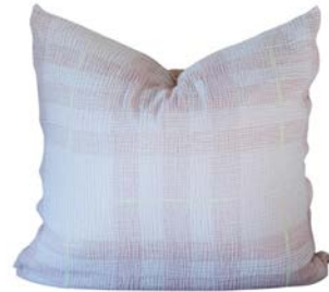
MIA GAUZE CHECK PILLOW PINK/OLIVE 65X65CM | AHCU255 100% COTTON £87.50