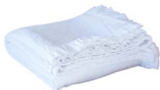
ALTA BEDPSREAD WHITE 220X230CM | AHBD112 100% COTTON £235