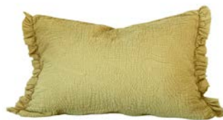
ALTA CUSHION OLIVE 40X60CM | AHCU256 100% COTTON £70