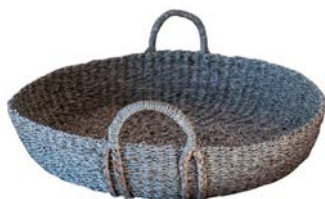
KUTEN ROUND SEAGRASS BASKET WITH WATER HYACINTH HANDLES LARGE 52x11CM | AHBS127 £52