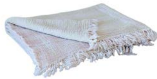
MIA GAUZE CHECK THROW REVERSIBLE 130X171 CM | AHTH135 100% COTTON £98