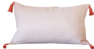
NATTI PRINT CUSHION CORAL 30X50CM | AHCU253 100% COTTON MUSLIN £45