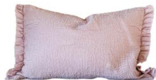
ALTA CUSHION BLUSH 40X60CM | AHCU257 100% COTTON £70