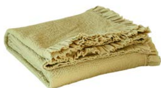
ALTA BEDPSREAD OLIVE 220X230CM | AHBD110 100% COTTON £235