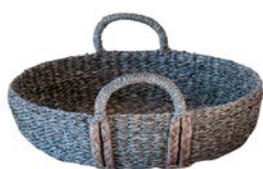
KUTEN ROUND SEAGRASS BASKET WITH WATER HYACINTH HANDLES SMALL 36X9CM | AHBS127 £38